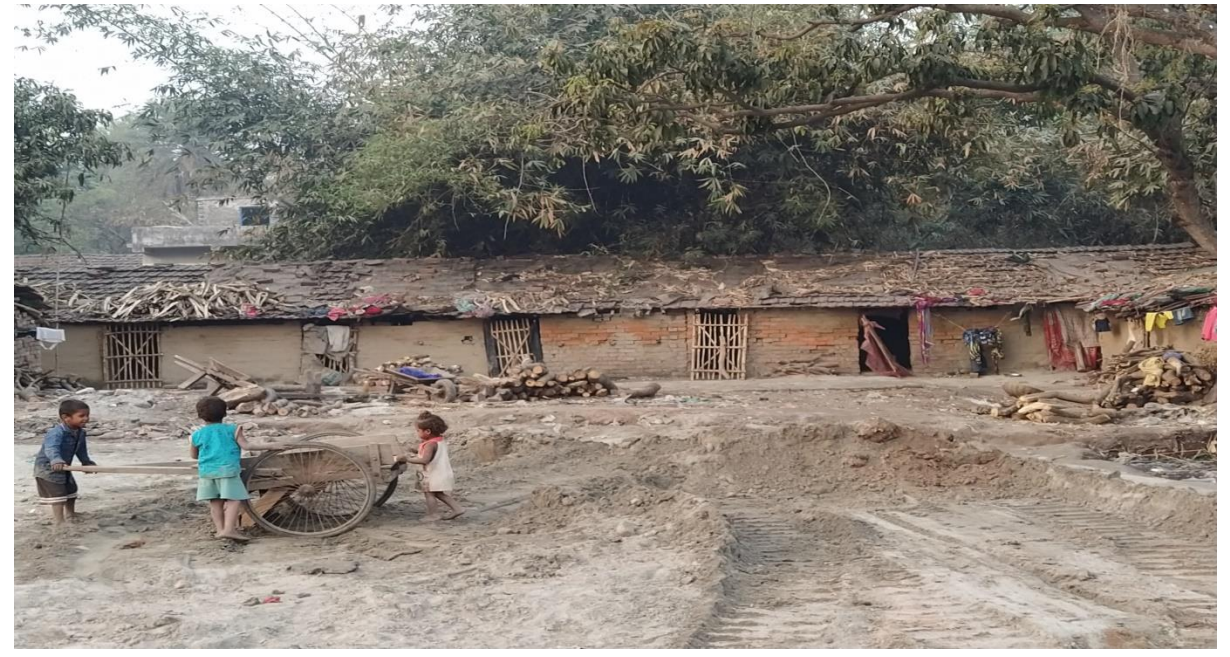
A shanty which serves as a living quarter for the labourers of the brick kilns.

plight owing to the language barrier is sometimes preyed upon even by the likes of sexual predators from within and beyond the boundaries of the brick kilns as their voices, if ever heard, are never understood by organisations protecting legal rights of human beings.