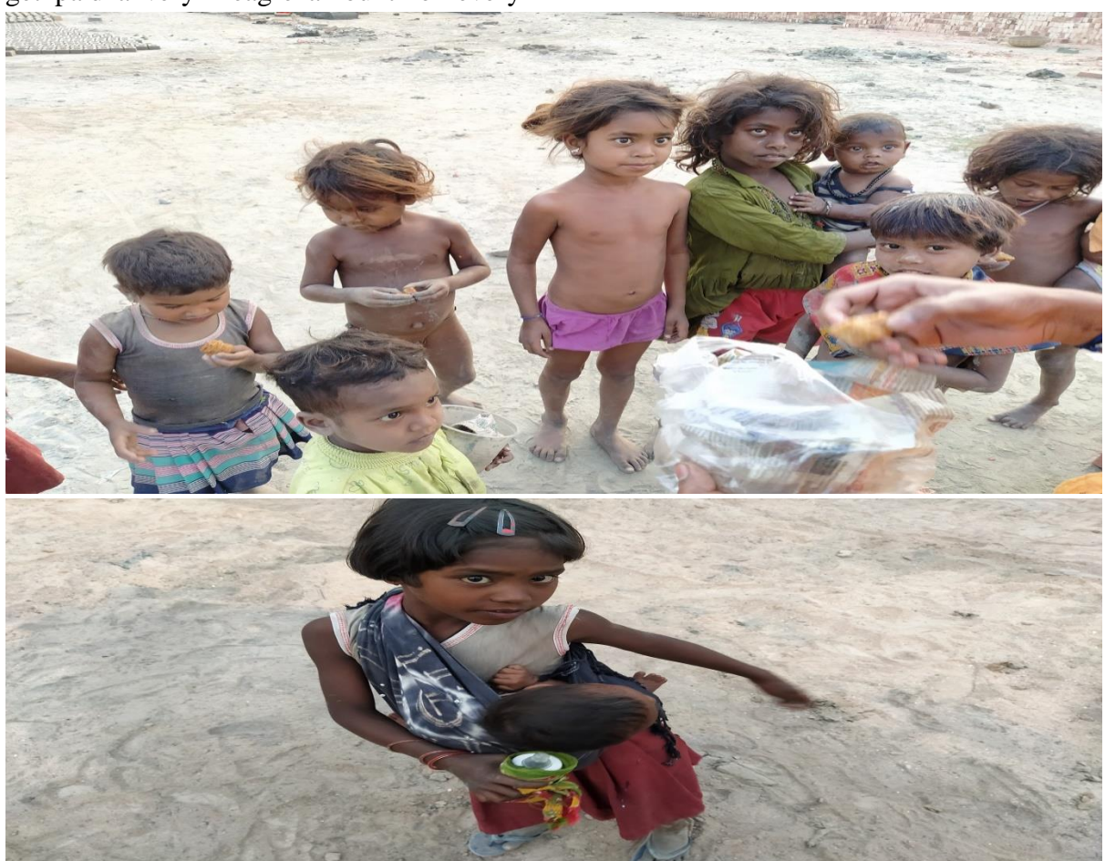
Photograph of children from the brick kilns (above) A girl nurtures her younger sibling while their parents work in the kilns (below)

thousand bricks moulded. So very often, children below legal age take part in the brick moulding process in order to maximise family income.