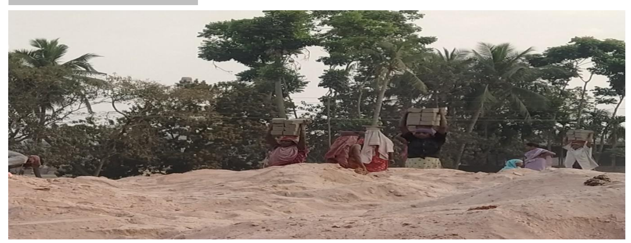
Labourers at work in a brick kiln.

In this paper, I have tried to trace how inability to communicate in a barrierbreaching Indian language has imprisoned the labourers in quite a few of the brick kilns in West Bengal in a system of bonded labour that resembles slavery in its very essence. The field visits for this paper were conducted in a couple of brick kilns in the area of Nilgunge which is located in the vicinity of the Barasat town in West Bengal.