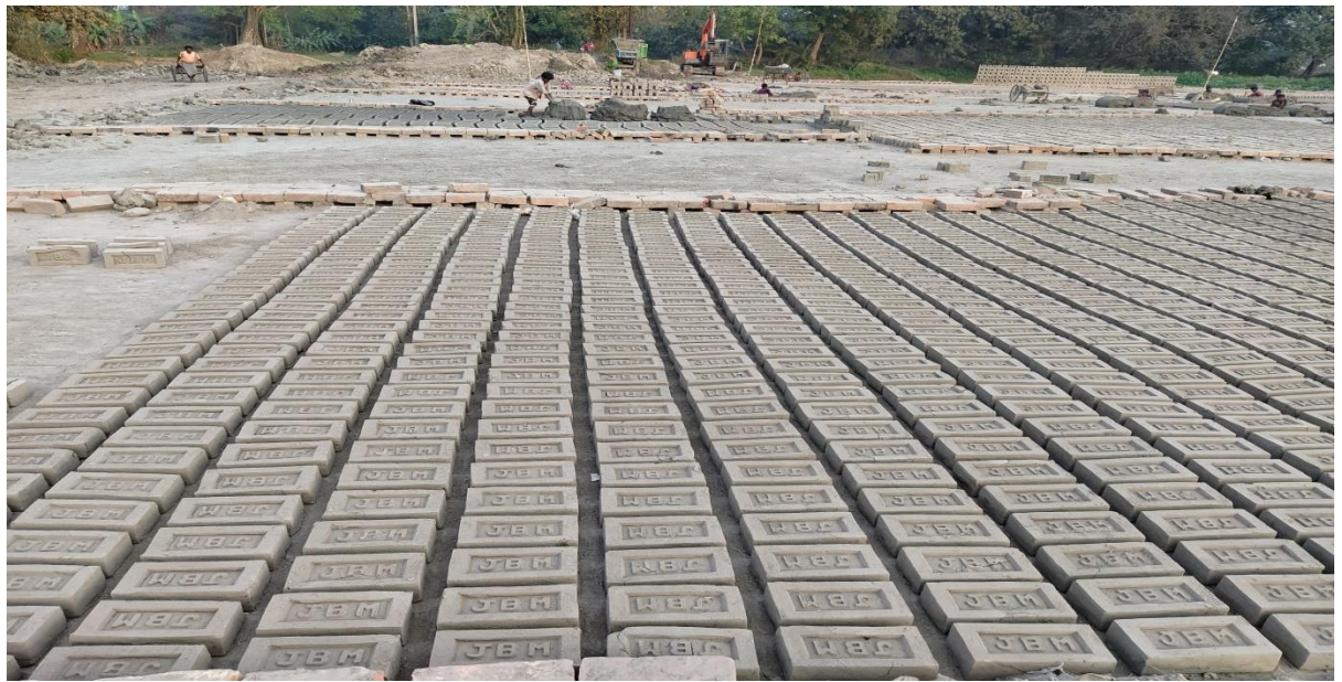
Moulded bricks waiting to be hard-burnt.

residents. Thus the villagers are often unable to converse in any other language but the one which they have been acquainted with since birth. This proves to be a barrier to communication between them and the local community beyond the walls of the brick kilns where they serve.